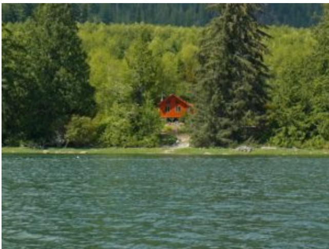
Image: Our cabin in the woods, with our 50 acres of alder forest in the background.