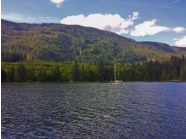
Image: The Awen anchored in Collingwood Bay.